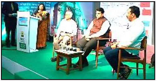
Panel Discussion in presence of Hon. CM, Mr Devendra Phadanvis